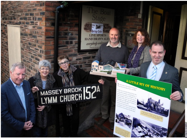
LEFT: An early publicity shot for local press