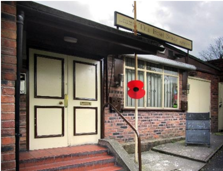
LEFT: The Royal British Legion just before it closed in March 2015