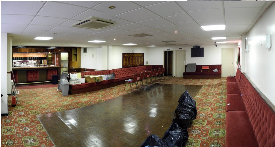
LEFT: The interior prior to the start of work—note the suspended ceiling and lack of natural light.