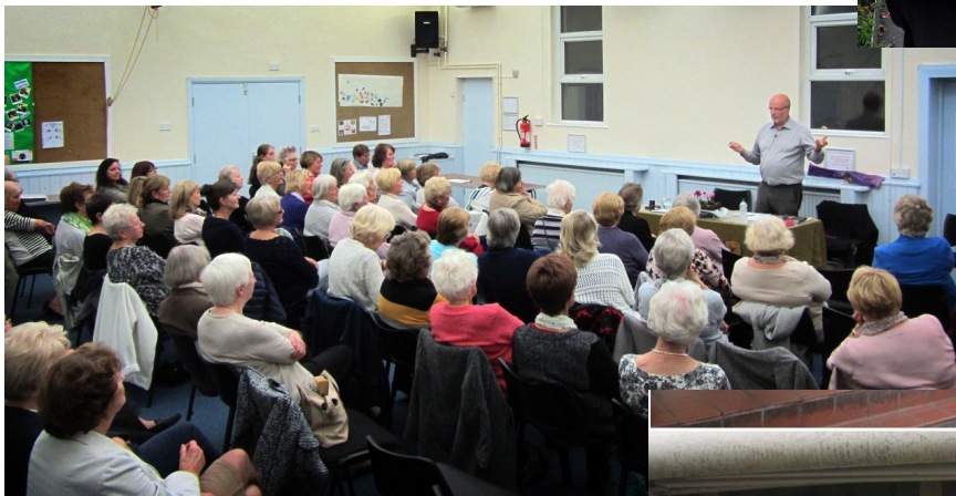
LEFT: One of the meetings we held to enthuse and inform local people—this one was with a WI group who have now also raised funds for us.