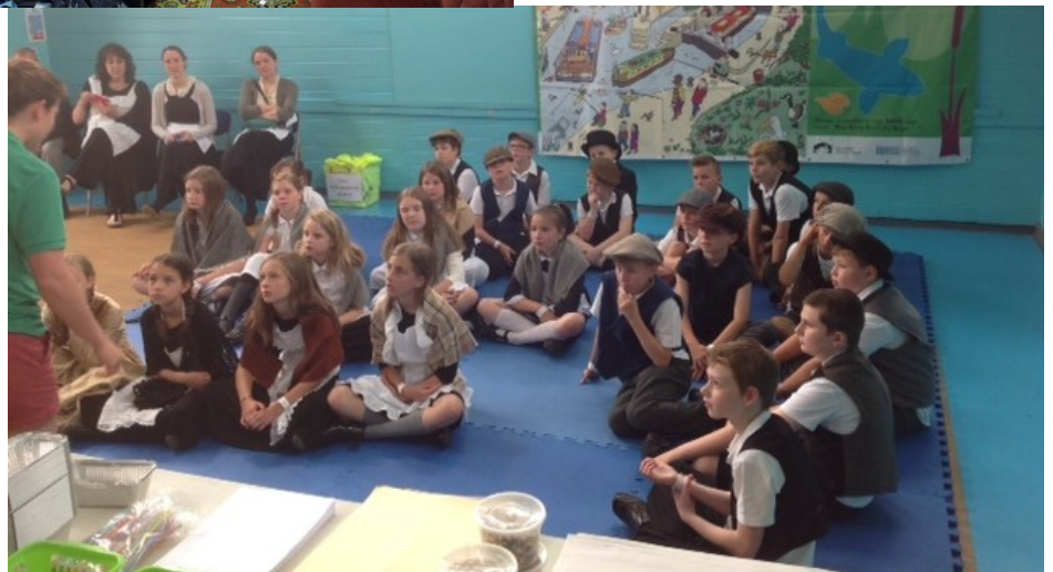
RIGHT Heritage Centre led learning activities being carried on in the sports hall of the adjacent community centre.