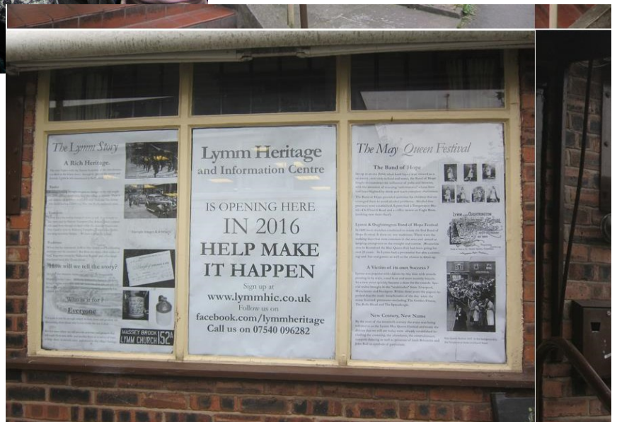
RIGHT : A bit of early awareness raising in the window of the former Royal British Legion