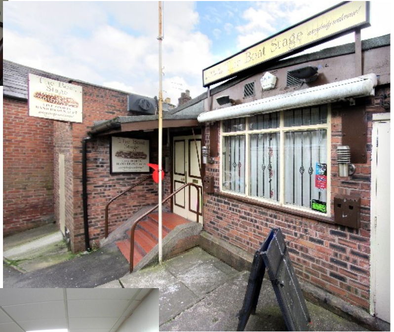
RIGHT Due to the location of the building this window in the front was the only external light to the building