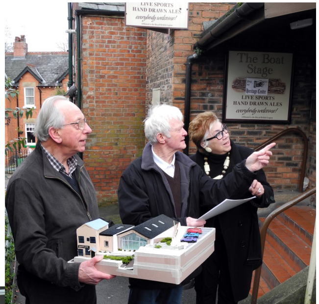
RIGHT: Two of the team showing our model to a local resident who used to live in a cottage on the site